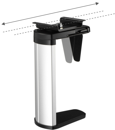
Under desk slide function